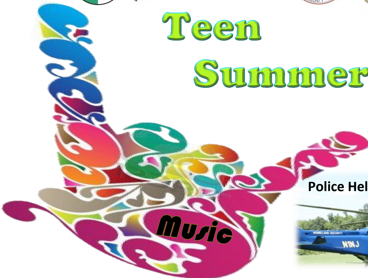
Police Helicopter Landing